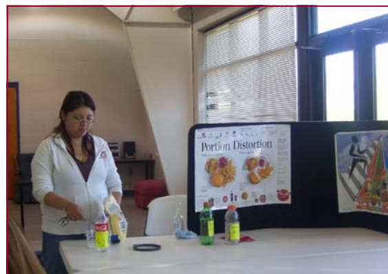
Hall County youth learn the importance of the Food Pyramid and Portion Control.

EFNEP, established in 1969, is conducted through Cooperative Extension nationwide. Sessions are available for parents who receive WIC, TANF and free and reduced school lunch. Grandparents who are raising their grandchildren also qualify.