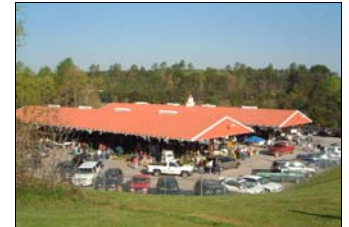
Buyers and sellers are welcome at the Hall County Farmers Market starting Friday May 13th.

Imagine a picnic table filled with platters of food made with fresh produce grown in Georgia. It would be an endless smorgasbord of delicious delicacies fit for a king. At that table, folks would agree, Georgians know how to roll out the red carpet with good wholesome food and fine southern hospitality.