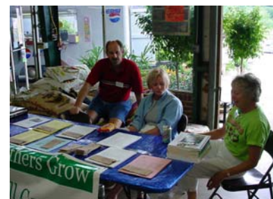
'Ask a Master Gardener' clinics are held at many local nurseries and garden centers.

Thanks for all you do for Hall County 4-H!!!