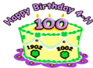
Celebrating 100 Years of Georgia 4-H

For their many contributions to the State of Georgia, Saturday, March 19 th was declared Georgia Master Gardener Day.