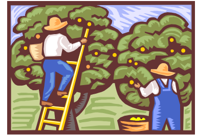
Thin peaches to 4 to 6 inches apart for large, high-quality fruit.

Successful eggplant development is dependent on a span of temperatures (80 to 90 degrees F) and plenty of water. Water well when the plants are young. Water at least two times a week when temperatures are high and there is no rain.