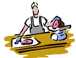
ServSafe manager training is required in many school systems, restaurants, child care centers, and hospitals.

This food safety training features the FDA Food Code updates, the most current regulations, best practices and science-based information. ServSafe manager training is required for many school systems, restaurants and child and elder care centers and hospitals. For more information or an application call our office.